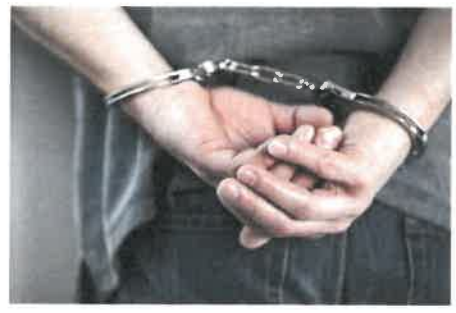
Two Fidelity Employees Arrested For Robbery