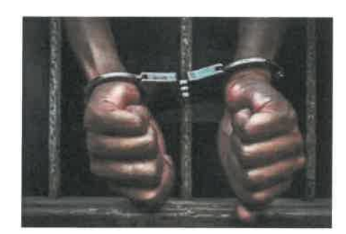
Boyfriend Sentenced To Life Imprisonment For Girlfriend's Murder